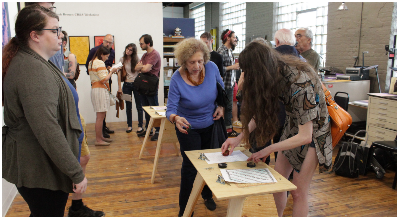
Image: Opening Reception of Noah Breuer: CB&S Werkstatt (6/7/2019-7/27/2019)

The Spudnik Press Exhibitions Program invites artists and curators to submit proposals to be considered for the 2020 cycle of exhibitions. This is an opportunity for artists to spotlight their work in a solo show, a group to build a collaborative exhibition, or a curator to make their vision a reality. Proposals may be for existing or new work. Any and all are welcome to apply.